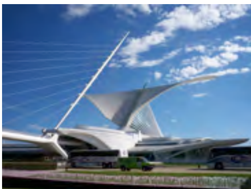
The Milwaukee Art Museum with the roof wings extended